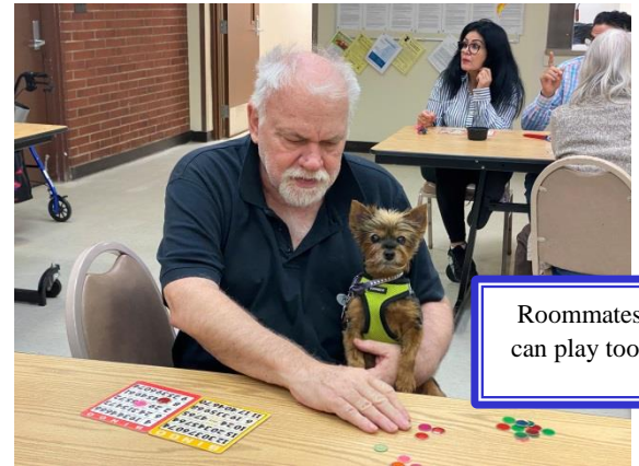
Roommates can play too!