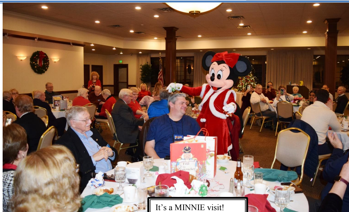
It's a MINNIE visit!